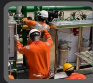
SPDC - EPCI OF FIVE (5) AUTOSAMPLER UNIT