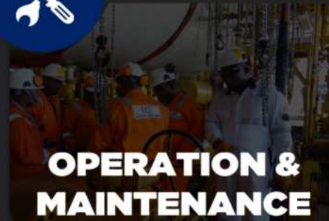
OPERATION & MAINTENANCE