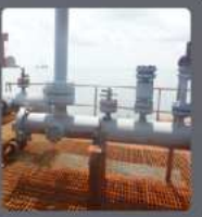
ADDAX PETROLEUM - ADANGA BLASTING & PAINTING