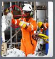
ADDAX PETROLEUM - OPERATION AND MAINTENANCE OF ADANGA MOPU