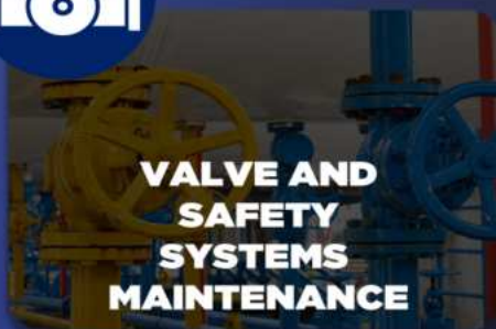
VALVE AND SAFETY SYSTEMS MAINTENANCE