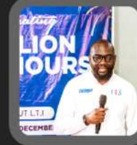
CELEBRATING 1 MILLION MAN HOURS WITHOUT L.T.I