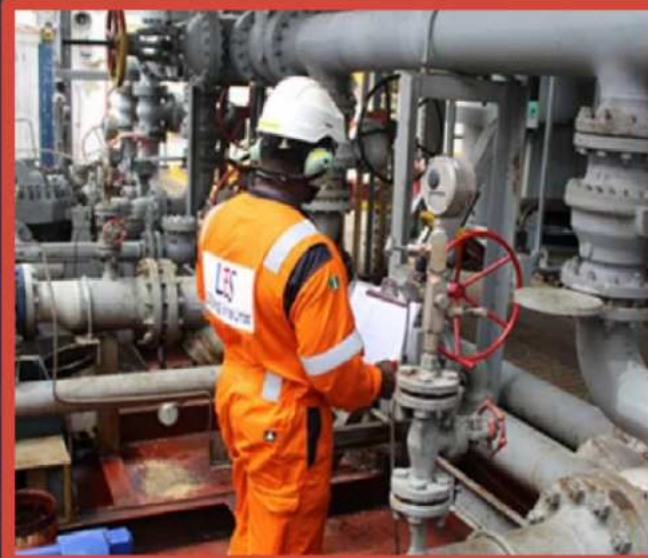
EXTENDS ASSET LIFE CYCLE