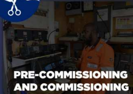
PRE-COMMISSIONING AND COMMISSIONING