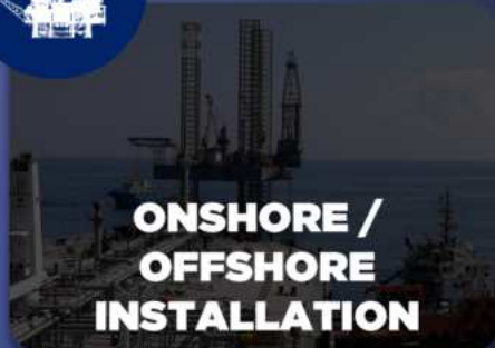
ONSHORE / OFFSHORE INSTALLATION