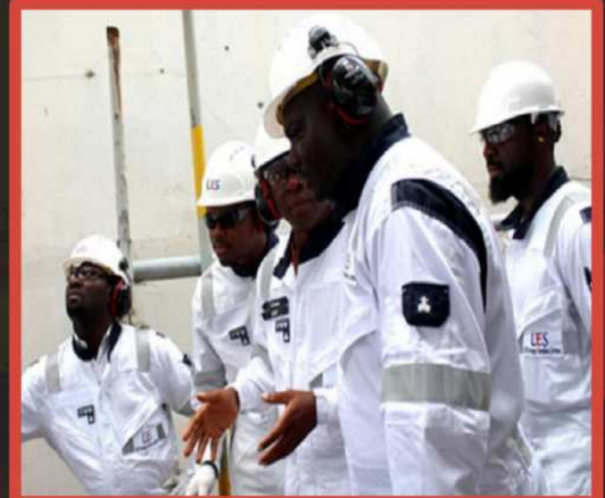
SKILLED AND MULTI DISCIPLINED TEAM