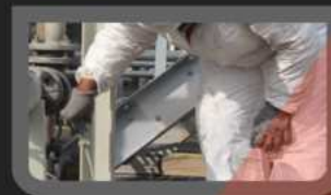
NLNG - FABRIC MAINTENANCE