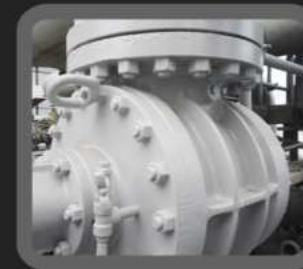
CHEVRON - AGBAMI FABRIC MAINTENANCE